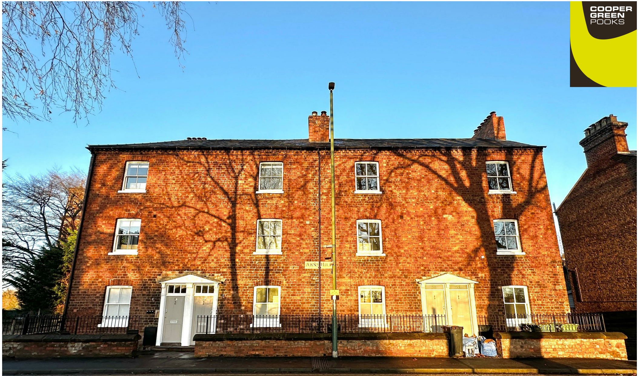
Flat 3, 57, St Michaels Street, Shrewsbury, SY1 2HA £800 Per Month